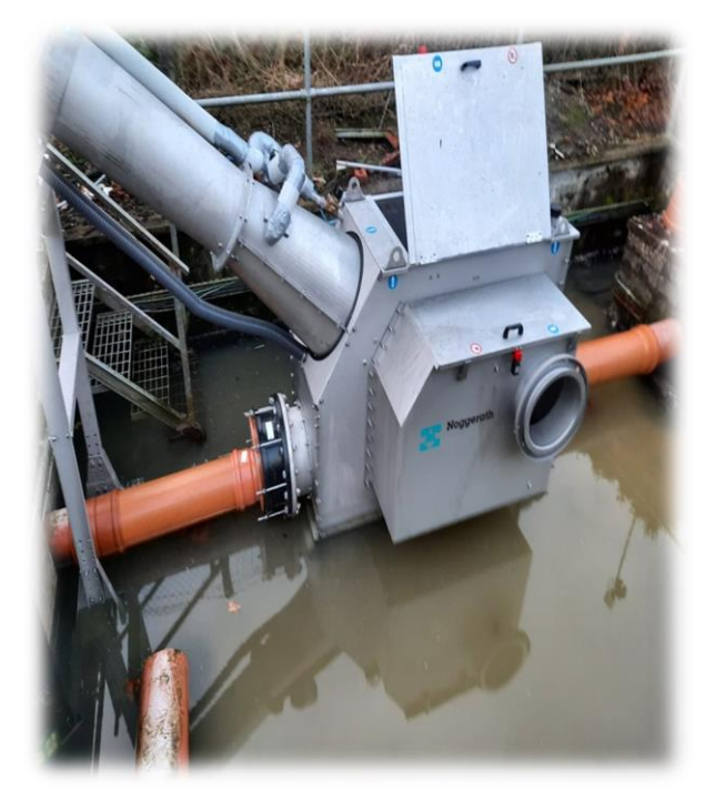
Aughrim Screen Upgrade.

Upgrade works are on-going at a number of plants throughout the County. This is to help provide for the ever-increasing population of Wicklow and ensure that the capacity is within the plants. Currently upgrading Barndarrig Wastewater Treatment Plant. Installation of new inlet screen, control panel and two large primary settlement tanks.