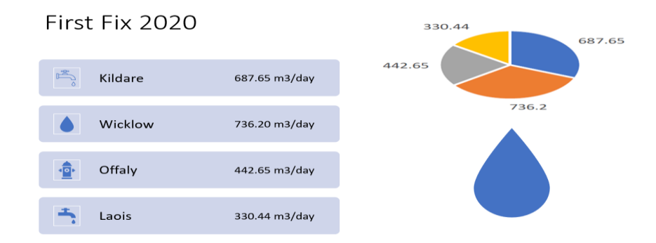
Figure 1. First Fix 2020 - (Wicklow Co Co crews 736.2m3/day)

The leaks identified by the Wicklow County Council Leakage crews up to October alone saved 736m³/day going out of the system as unaccounted for water, this figure to year end is expected to reach 880m³/day.