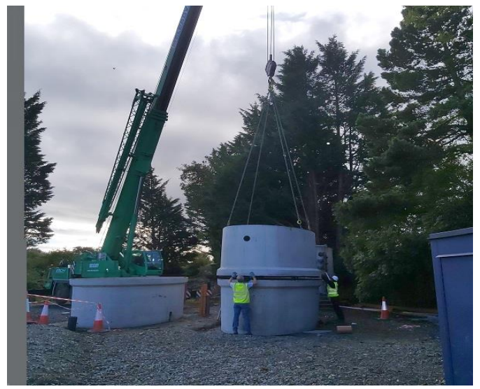
Installation of Settlement Tanks Barndarrig.

Upgrade works are on-going at a number of plants throughout the County. This is to help provide for the ever-increasing population of Wicklow and ensure that the capacity is within the plants. Currently upgrading Barndarrig Wastewater Treatment Plant. Installation of new inlet screen, control panel and two large primary settlement tanks.